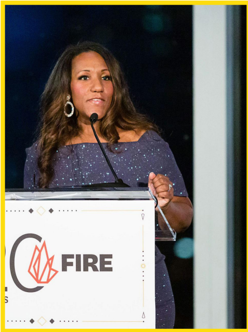
FIRE's 20th Anniversary Gala NYC